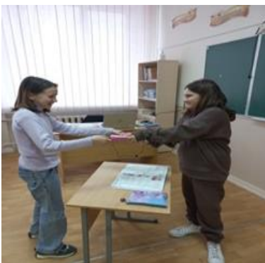
Picture 5. Dialogue