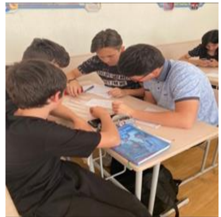
Picture 3. Group work